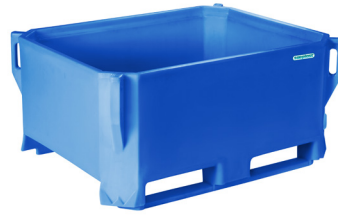
Dalvík/Spain 160 PUR