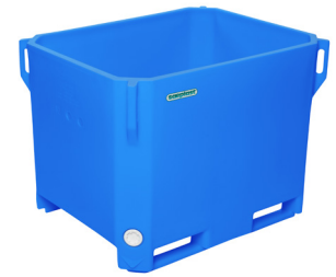
Dalvík/Spain 310 PUR