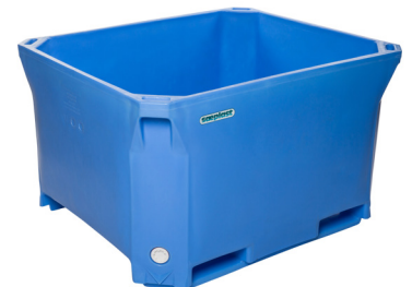
Canada D660T PUR