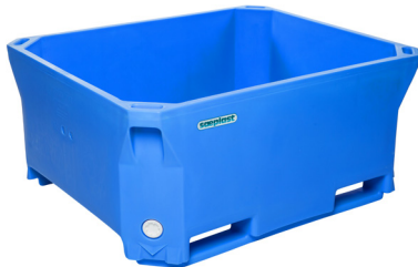
Canada D460 PUR