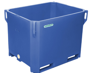
Dalvík/Spain 380 PUR