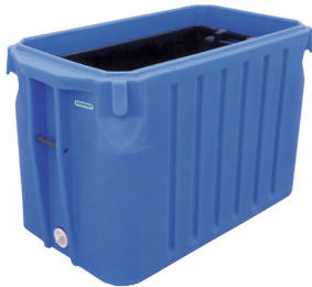
Canada DX310 PUR