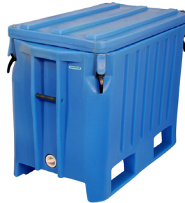
Canada DX310F PUR