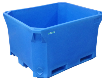
Canada D660 PUR