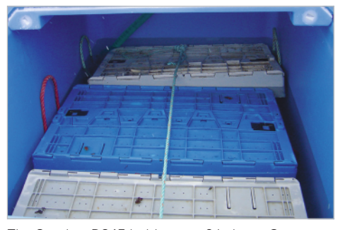
The Sæplast D345 holds up to 6 Lobster Crates