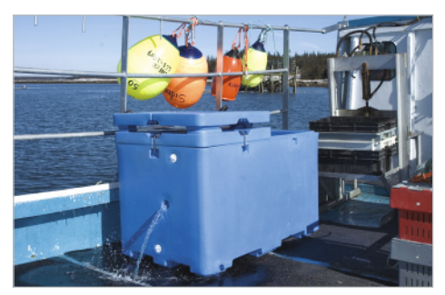
Three levels of drains